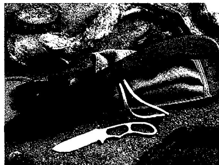
The KA-BAR Johnson Adventure Blades Potbelly is 12.6" of heavy-duty camp knife that can chop and butcher with the best of them.

The blade, of 1095 cro-van (a favorite among high-carbon steel fans) is not stainless but has a tough black coating, and a little oil along the edge will give you all the