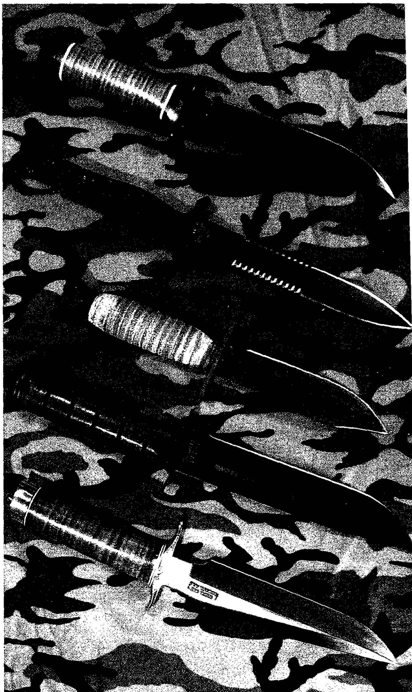
The top five tactical legends (bottom to top): Randall 1-7, USMC Ka-Bar, Ontario ASEK Survival Knife System, Gerber Mark II, and SOG Bowie 2.0

Another long-serving war knife is the USMC Ka-Bar. It has been a while since it was the standard issue for the U.S. Marine Corps, but it is still sold in Post Exchanges (PX), and is still one of the most popular knives among the Devil Dogs. In talking to former Marines, their experiences with the Ka-Bar were so positive, the knife serves